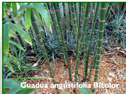
Guadua angustifolia Bicolor

Fort Lauderdale, Florida www.bambooforyou.com Reprint of Ad missing in the Aug03 issue