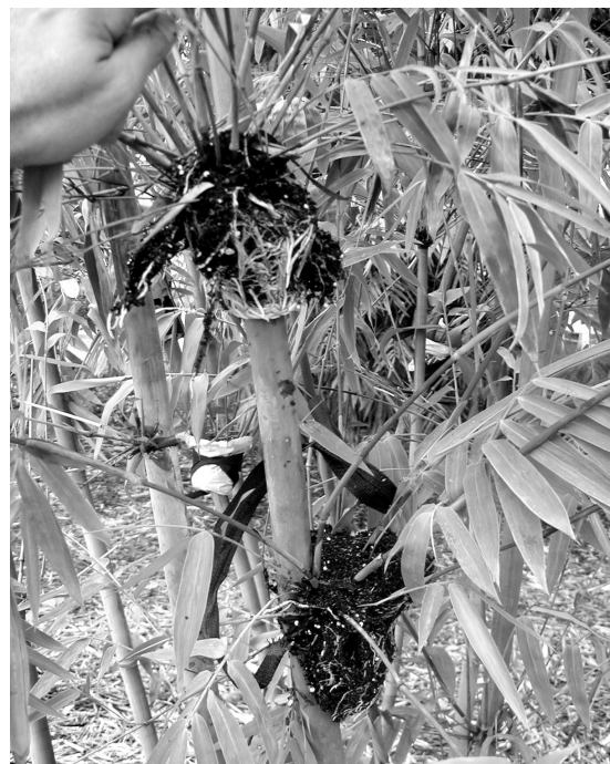
Unwrapped root-mass on B. chungii —ready to be removed.