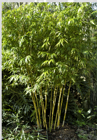
B. eutuldoides viridi-vittata