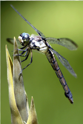
Dragonfly on shoot tip of a true Dragon's Nest— B. disseminator